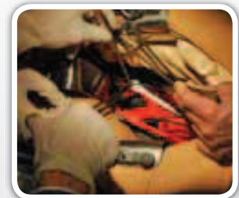
Preparation for a bifurcated graft