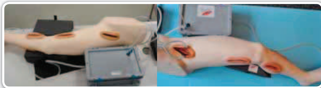
View of the new perfused leg model with waterpump and tube system

The new perfused leg model with four typical vascular wounds and realistic bone skeleton is suitable for the training of open peripheral vascular surgery.