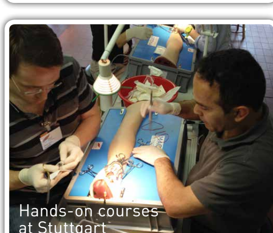
Hands-on courses at Stuttgart