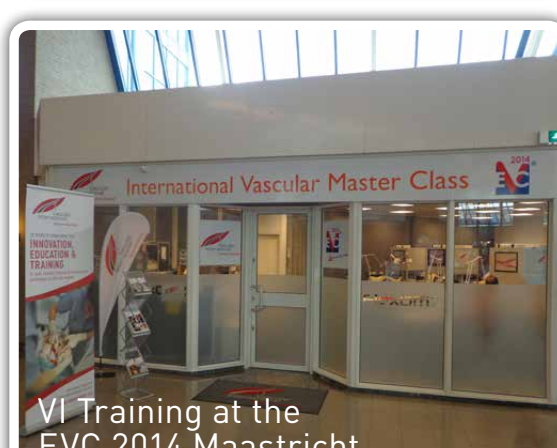
VI Training at the EVC 2014 Maastricht